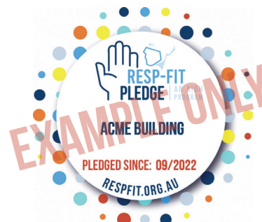
The RESP-FIT Pledge badge

VISIT RESPFIT.ORG.AU OR EMAIL RESPFIT@AIOH.ORG.AU FOR FURTHER INFORMATION