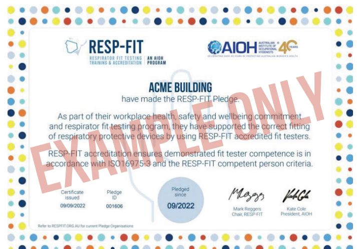
The RESP-FIT Pledge certificate